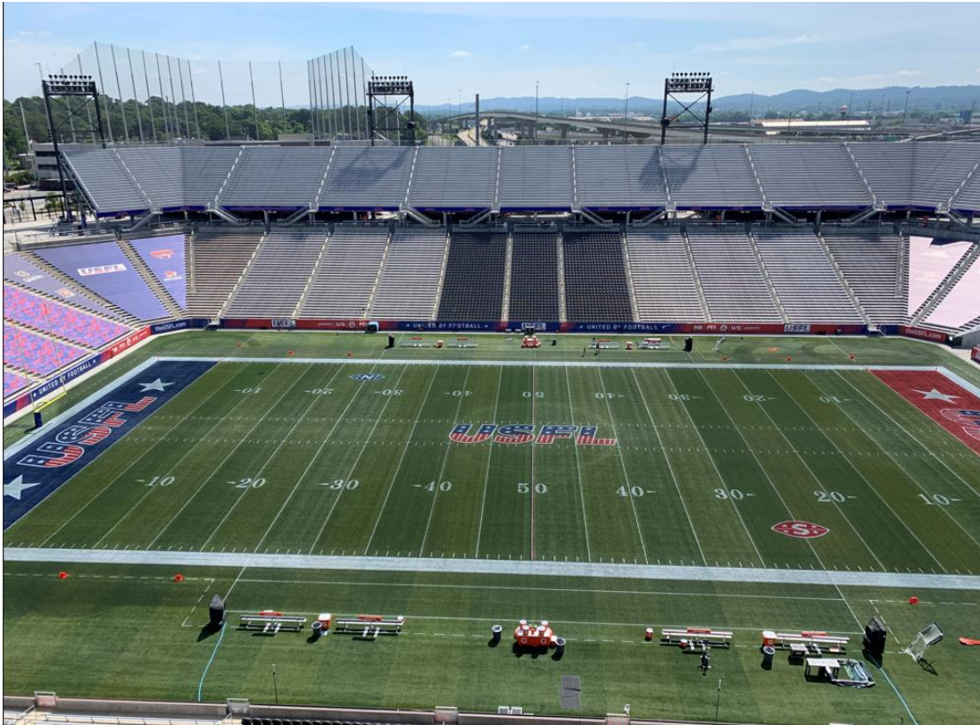
Layout: Legion field from midfield